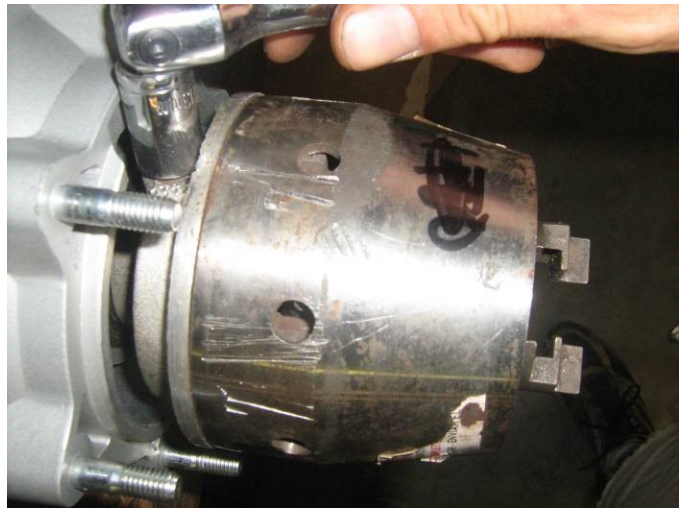
#6A. LOOSEN JAM-NUT WITH 13MM SOCKET