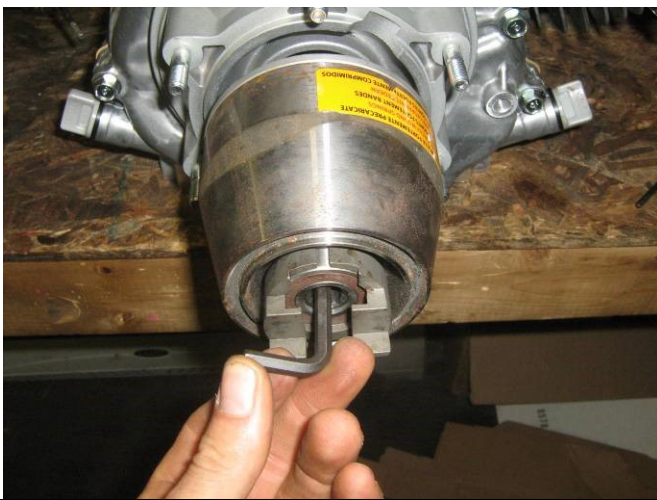
#5B. NEW STYLE MOUNTING: DETERMINE WHICH ALLEN WRENCH NEEDED (3/16", 7/32" OR 1/4", DEPENDING ON CLUTCH MODEL) TO LOOSEN CLUTCH HOLDING BOLT (NOTE: DO NOT USE AN ALLEN WRENCH WITH A "BALL END" AT THE TIP!!