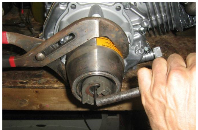
#6B. USING CHANNEL-LOCK PLIERS, STRAP-WRENCH, PIPE WRENCH, ETC. TO KEEP CLUTCH FROM TURNING, PUT A LEVERAGE PIPE (OR A VISE-GRIP) ON ALLEN WRENCH AND LOOSEN BOLT. BOLT IS STANDARD RH THREAD. (THIS PICTURE ACTUALLY SHOWS TIGHTENING BOLT...BUT YOU GET THE IDEA)