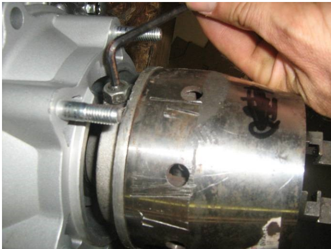
#7A. LOOSEN ALLEN-HEAD SET SCREW WITH 4MM ALLEN WRENCH